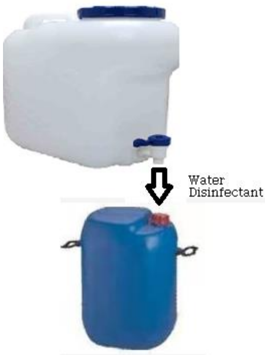
Figure.4 Chemical disinfection