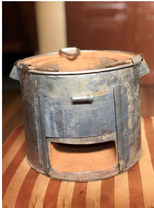
Figure 1: Photo of Fahatokiana ICS

All ICSs will be produced in local factories, then they will be distributed to households free of charge.