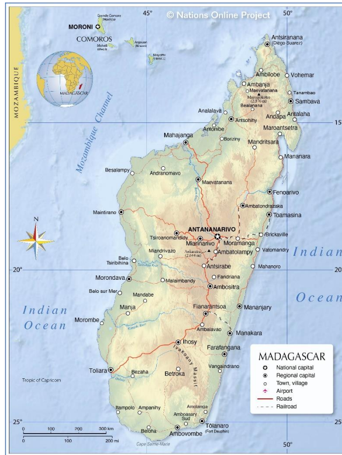
Figure 3: Project boundary is across Madagascar

A diagram of the energy flow in baseline boundary and project boundary is shown below: