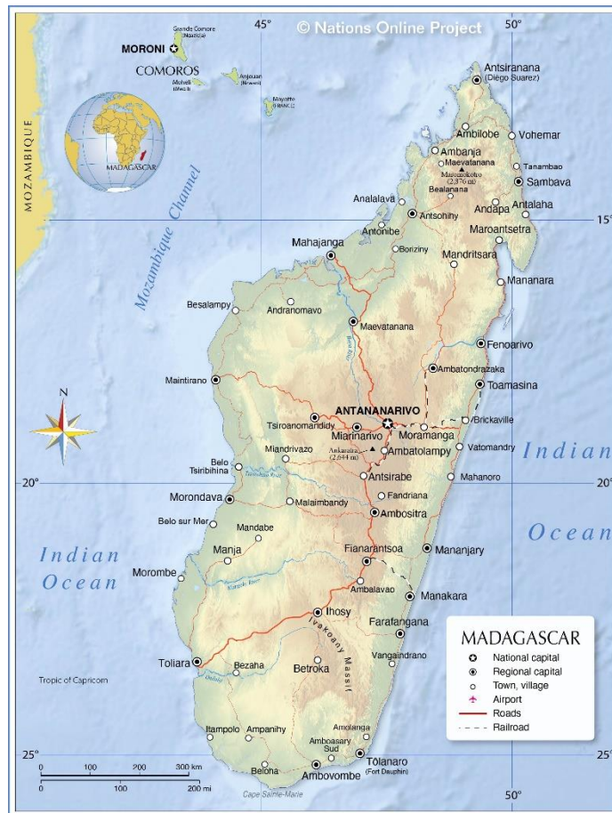
Figure 2: Map of the Republic of Madagascar