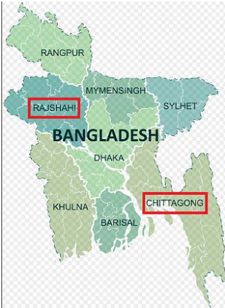
Figure 1. Chittagong and Rajshahi Division of Bangladesh