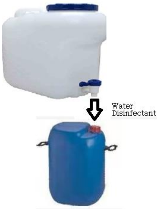
Figure.4 Chemical disinfection